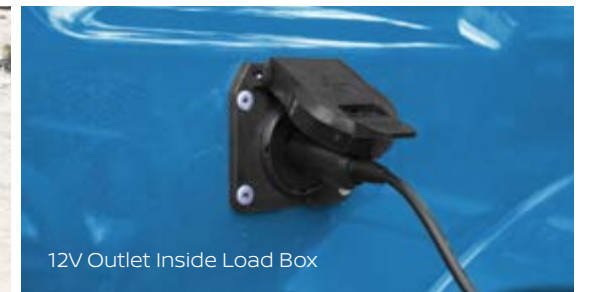
12V Outlet Inside Load Box