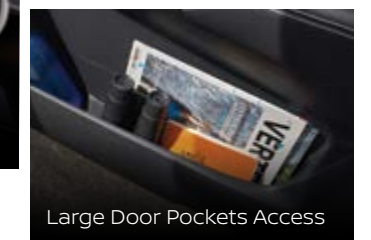
Large Door Pockets Access