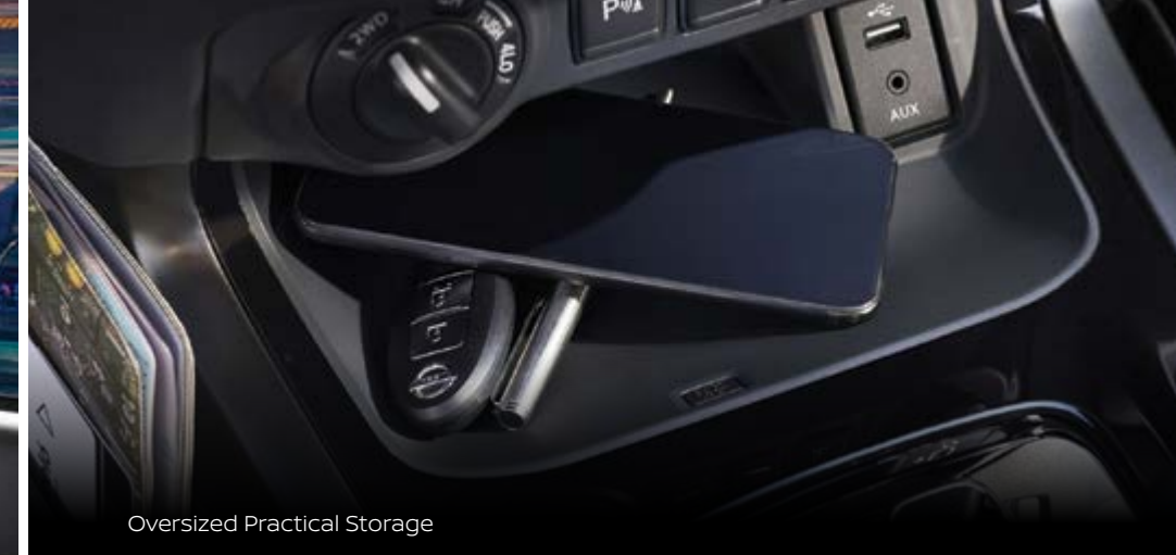
Oversized Practical Storage

Form meets function as you discover how the Navara cabin has been thoughtfully planned out to seamlessly integrate into every moment; be it for work, play or leisure. Generous storage areas, sunglass stowing, an oversized glove box and multiple charging points make the all-New Navara the perfect companion for everyday life.