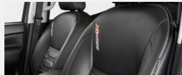
BLACK LEATHER SEATS (PRO-4X Model)