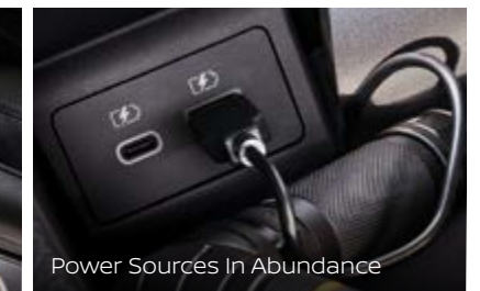
Power Sources In Abundance