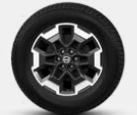
18" ALLOY (LE Plus Grade)