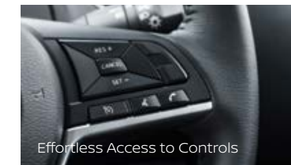
Effortless Access to Controls

Navara maximises storage inside and out. The rear seats feature secure under-seat storage and boast the ability to remain conveniently flipped up to help transport taller items.