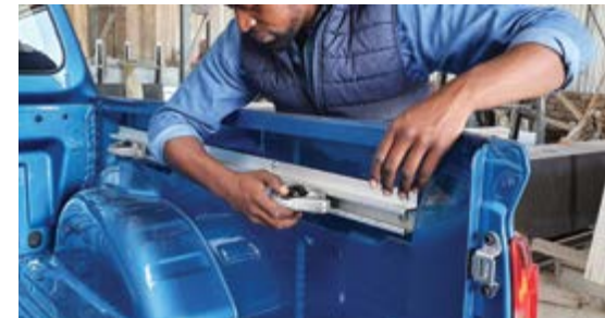
UTILI-TRACK CHANNEL SYSTEM

Gone are the days where a choice has to be made between hardworking and good looking. The all-new Navara boasts extensive range model depth, catering for every driver need and requirement, with several model and grade options across the board. The LE Plus Model offers exceptional levels of bold and dynamic styling, with generous levels of premium interior comfort, safety and connectivity technology; without compromising on tough hardworking credentials to tackle the harshest African conditions.