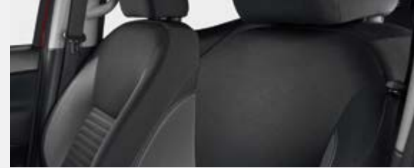
CLOTH SEATS (SE Plus and XE Single Cab* Model) *Grey vinyl option available