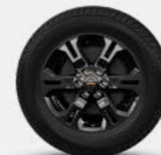
17" ALLOY (PRO-4X)

Nissan's commitment to quality: To provide all customers with a consistently high level of quality, Nissan applies the same standards worldwide, to ensure that all Nissan owners enjoy peace of mind for the lives of their vehicles. The approach is based on quality from the customer's perspective on three key elements: First, the expectation of a smooth driving experience with complete peace of mind. Second, the intangible appeal of a vehicle, its power to captivate and excite, with features that capture attention and imagination. Third, the level of attentiveness and service during the sales process, and long after the sale is concluded.