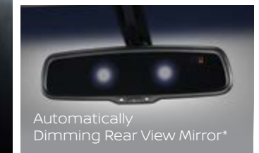
Automatically Dimming Rear View Mirror*