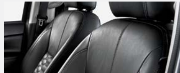
BLACK LEATHER SEATS (LE Plus Model)