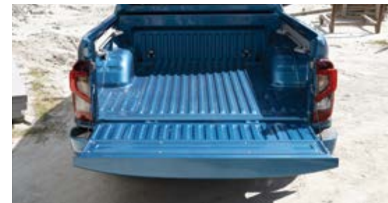
LOAD BOX FLOOR LENGTH

Special focus has been placed on towing and payload, so the new Navara features a stronger rear axle to allow for heavier loads with even more confidence. To accommodate the more powerful engine plus greater towing and payload capabilities, the rear brake size has been increased to reduce fade and provide more balanced stopping power.